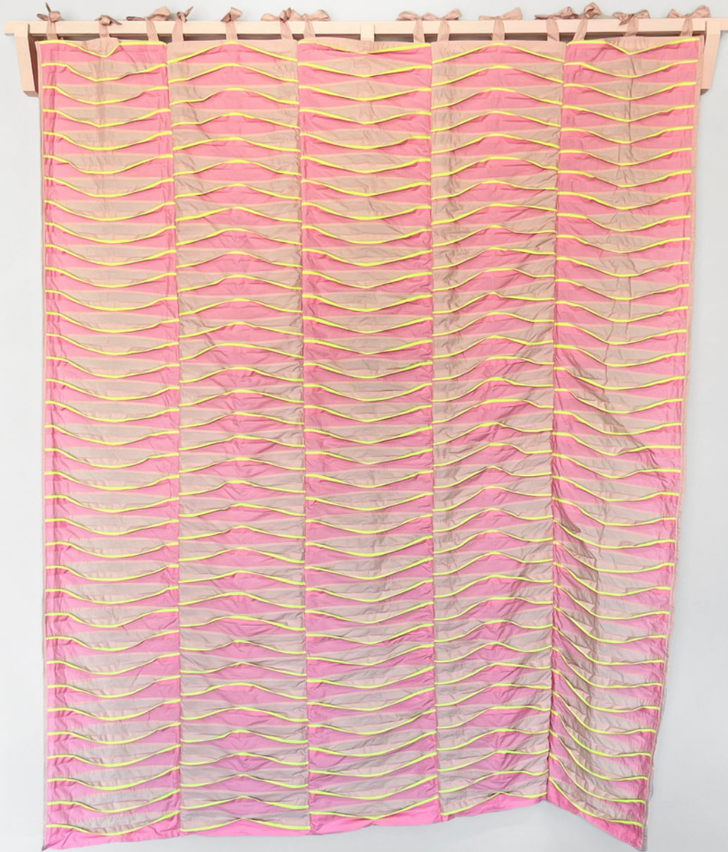
Wave Tuck Shower Curtain, 2023. Jenna VanFleteren

Polycotton broadcloth. Shower curtain with wave tucks in rose gold and candy pink with neon green accents.