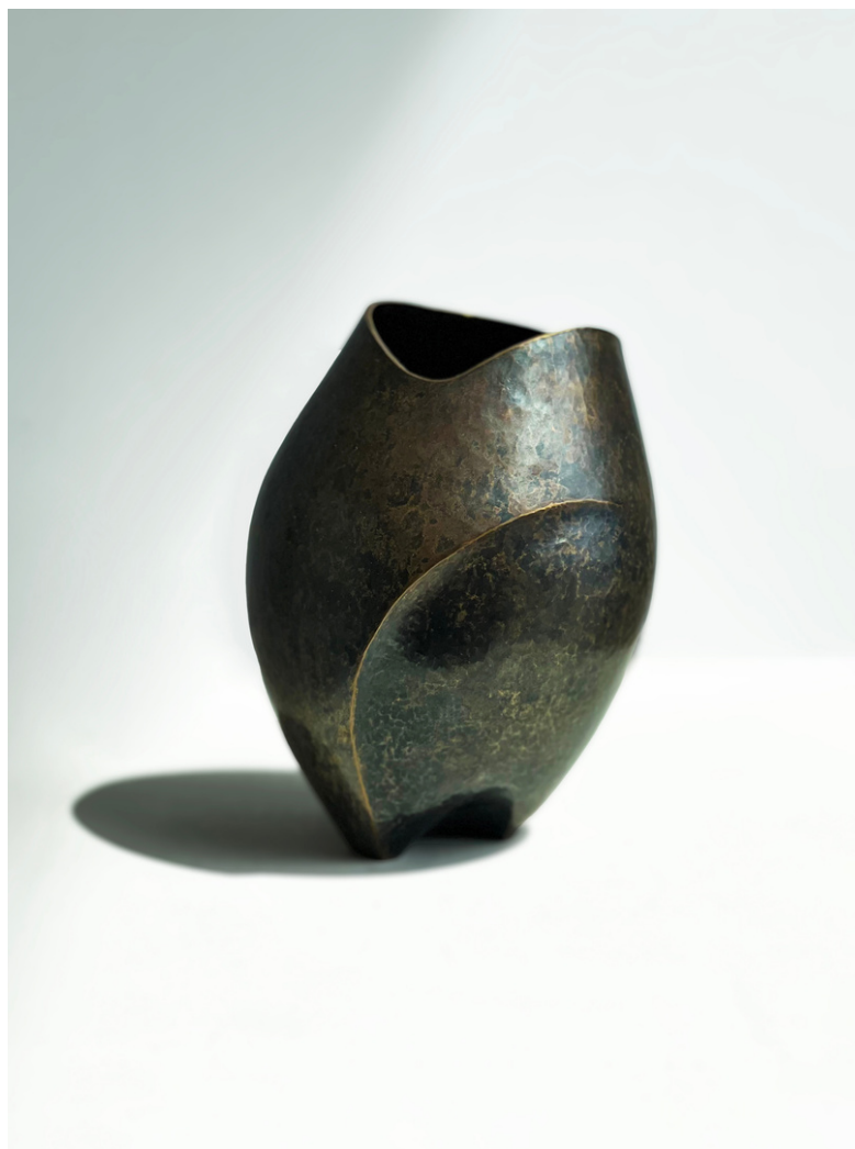
Bronze Vessel , 2021. Designer: Cassidy Kaufman Hand-raised bronze. 3 ½" x 3 ½" x 3 ½" Retail Price: $1,200.00