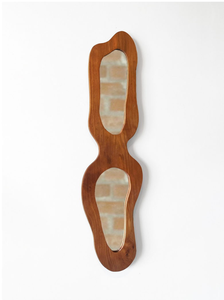
Zygote Mirror , 2022. Designer: Studio Shmudio Chestnut, mirror. 40 1/2" x 10 1/2" x 3/4" Retail Price: $1,800.00