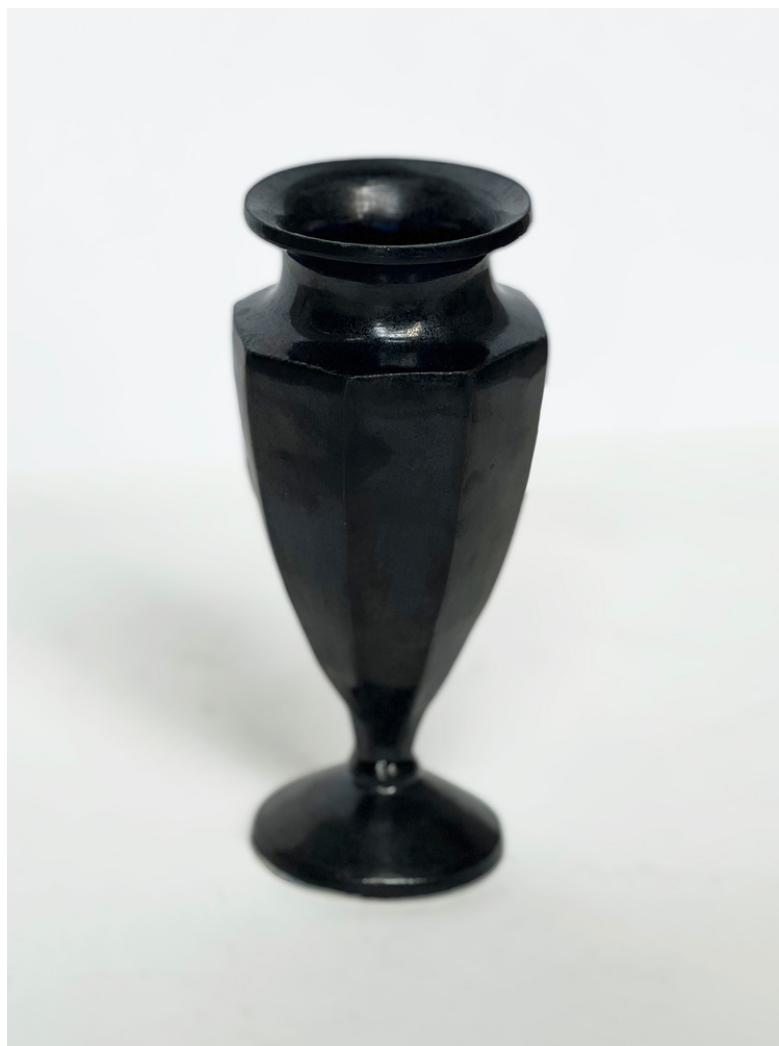
MPFTM (Pots from the Movies) , 2021. Designer: Benjamin Teague Porcelain, essential heavy metal glaze. 6 3 / 4 " x 3 3 / 4 " Retail Price: $750.00