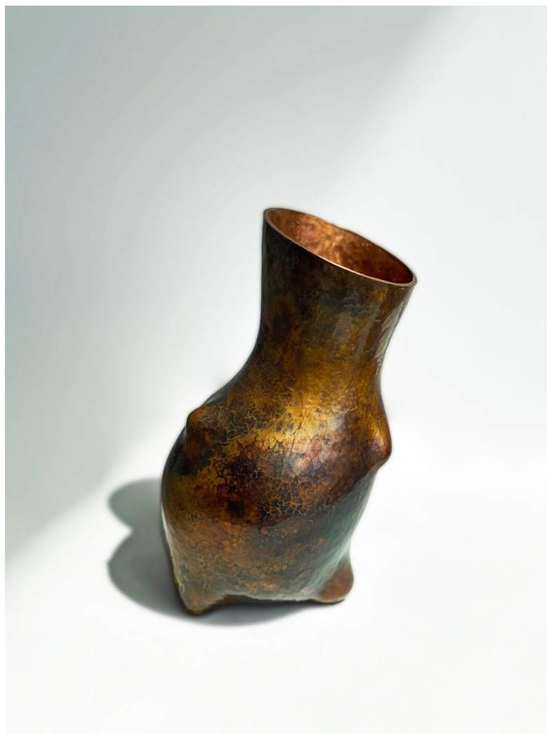
Dancing Vessel II , 2021. Designer: Cassidy Kaufman Hand-raised copper. 3 1/2" x 4" x 7" Retail Price: $750.00