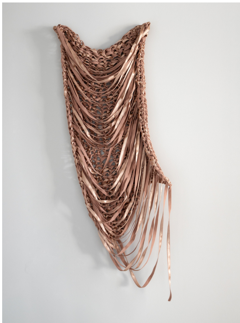
Torso (Shifting) , 2022. Designer: Katie Shulman Elastic bra strapping. 40" x 16" x 2" Retail Price: $2,800.00