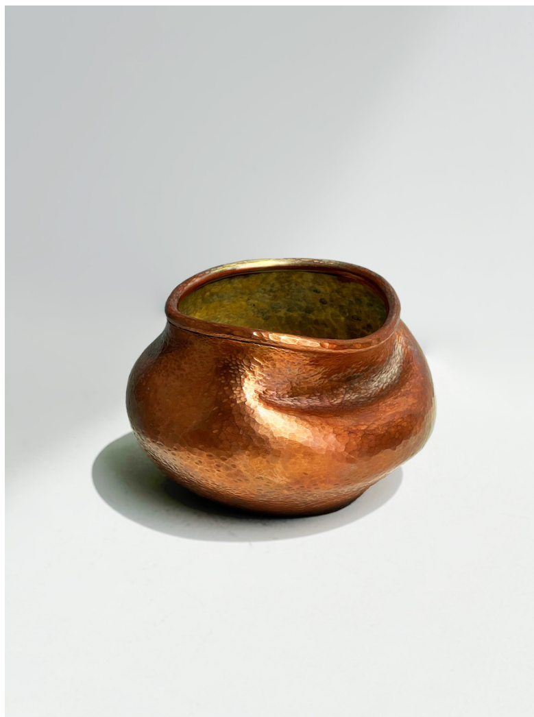
Copper Hallow Vase, 2021. Designer: Cassidy Kaufman Hand-raised copper with bronze rim. 4" x 4 1/2" x 3 1/4" Retail Price: $950.00